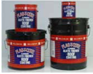
Formulated for Recreational Vehicles

Alkyd Fibered Roof Coating is a non-asphalt, high quality chemically engineered roof coating that contains long fibers, pigments and non-drying resins. It is a thick, white fibered or aluminum fibered colored coating with an amazing ability to conform to, and protect against all weather conditions. It has excellent acoustical and insulating qualities. Recommended for metal and fiberglass roofs (not suitable for rubber roofs or homes with asphalt shingles).