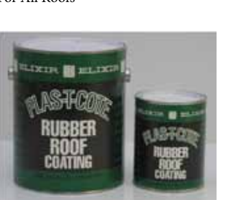
Made for R.V. Rubber Roofs