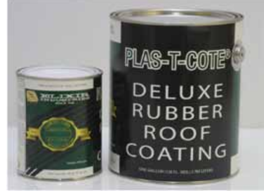
Made for R.V. Rubber Roofs